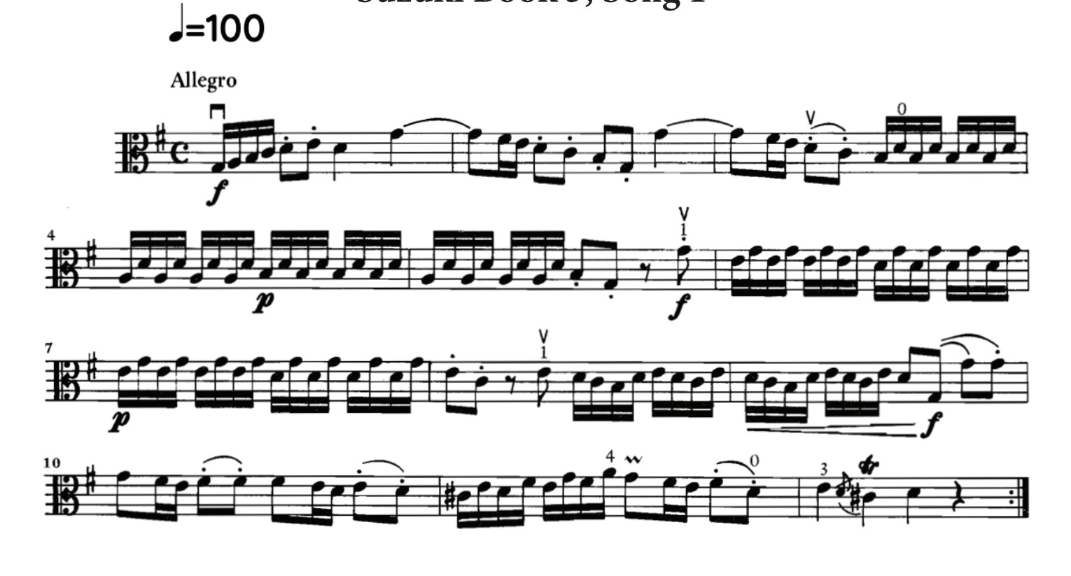
Sonata in G Major Second Movement Suzuki Book 5, Song 1